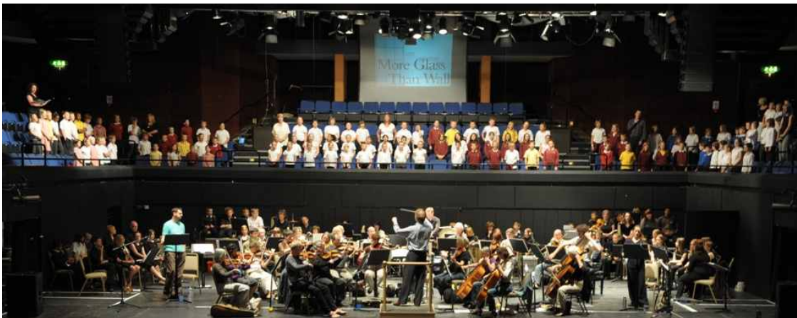
A previous ViVA education concert - More Glass Than Wall - in rehearsal at the Assembly Rooms, Derby.

Supported by Rolls-Royce plc, Derby City Council, Derby LIVE and Arts Council England